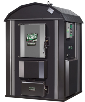
CLASSIC EDGE 960 TITANIUM HDX

Tested Efficiency (LHV) - 92.1%** Tested Efficiency (HHV) - 85.6%** Mfr's Rated Heat Output Capacity - 400,000 Btu/hr Heat Output (12 hr) - 212,957 Btu/hr