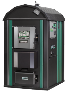
CLASSIC EDGE 560 TITANIUM HDX

Tested Efficiency (LHV) - 90.2%** Tested Efficiency (HHV) - 83.8%** Mfr's Rated Heat Output Capacity - 200,000 Btu/hr Heat Output (12 hr) - 92,417 Btu/hr