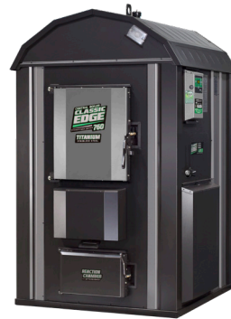
CLASSIC EDGE 760 TITANIUM HDX

Tested Efficiency (LHV) - 89.8%** Tested Efficiency (HHV) - 83.4%** Mfr's Rated Heat Output Capacity - 245,000 Btu/hr Heat Output (12 hr) - 146,686 Btu/hr