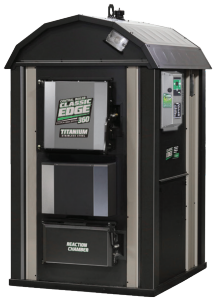
CLASSIC EDGE 360 TITANIUM HDX

Titanium-Enhanced Stainless Steel Firebox